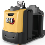
Tow Truck: 3.0 – 5.0 tonne capacity