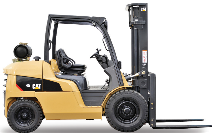
LP Gas range: 1.5 – 5.5 tonne capacity