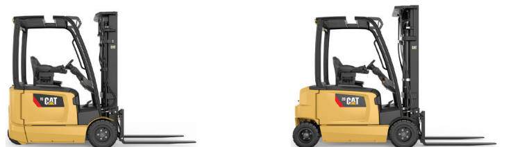
Electric range: 1.4 – 5.0 tonne capacity

The range covers every warehousing application, including demanding environments and operation in extremes of temperature, such as cold stores.