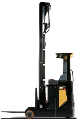
Reach Truck range: 1.4 – 2.5 tonne capacity