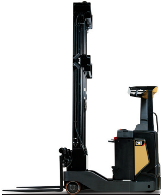
Multi-Way Reach Trucks: 2.0 & 2.5 tonne capacity