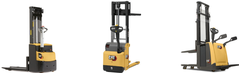
Stacker range: 1.0 – 2.0 tonne capacity