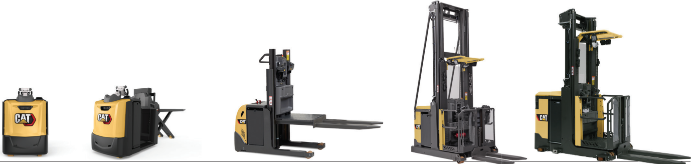
Order Pickers: 1.0 – 2.5 tonne capacity