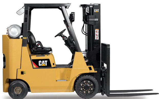
LP Gas Cushion range: 2.0 – 7.0 tonne capacity