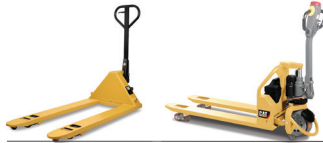
Hand / Power Pallet range: 1.2 – 2.5 tonne capacity

We strive to offer a solution for many areas of materials handling. The NTR30-50N2 is the tow truck of choice for many indoor towing applications, particularly in the automotive industry. It incorporates many built-in features which combine to provide the operator with a top quality, stressfree working environment. Whatever the product you handle, whichever way your warehouse operates, whatever racking configuration you have in place, there's a Cat Lift Trucks solution just waiting to help you optimize warehouse efficiency and your return on investment.